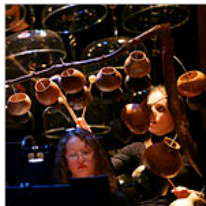
Dreams and Instruments of a Visionary Tinkerer