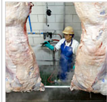
Processors Look for Ways to Keep Ground Beef Safe