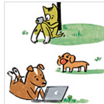
Hey Spot, You've Got Mail