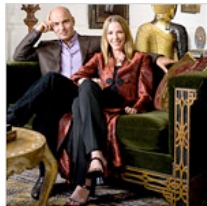
Kings' Riches in a Chelsea Domain